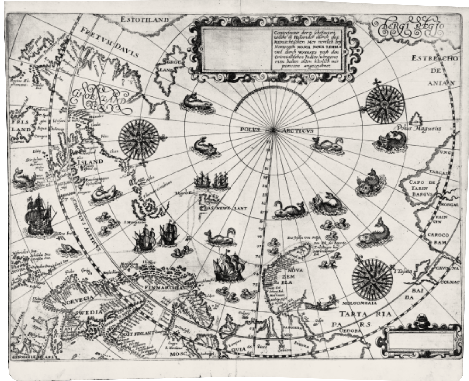
47.0 Map of the Far North, Theodore de Bry, 1599 (state 1).

The de Brys produced a reduced-size version of Bar-ent's map (Entry 46) to accompany their translation of the account of his expeditions. It appeared first in Part III of